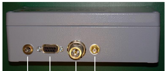
POWER DATA AIS ANT. GPS ANT.